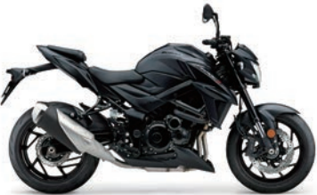
Metallic Mat Black No.2 (YKV)