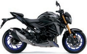
Metallic Oort Gray No.3 / Glass Sparkle Black (BD7)