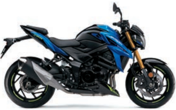
Metallic Triton Blue / Glass Sparkle Black (KEL)