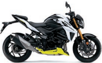
Pearl Brilliant White / Champion Yellow No.2 (B55)