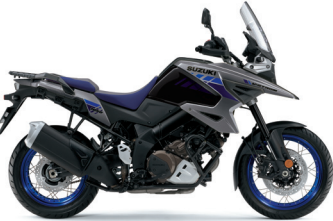
Metallic Oort Gray No.3 / Glass Sparkle Black (BD7)