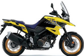
Champion Yellow No.2 / Glass Sparkle Black (BT1)