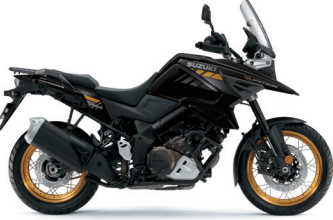
Glass Sparkle Black (YVB)