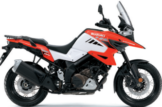
Pearl Brilliant White / Glass Blaze Orange (B1F)