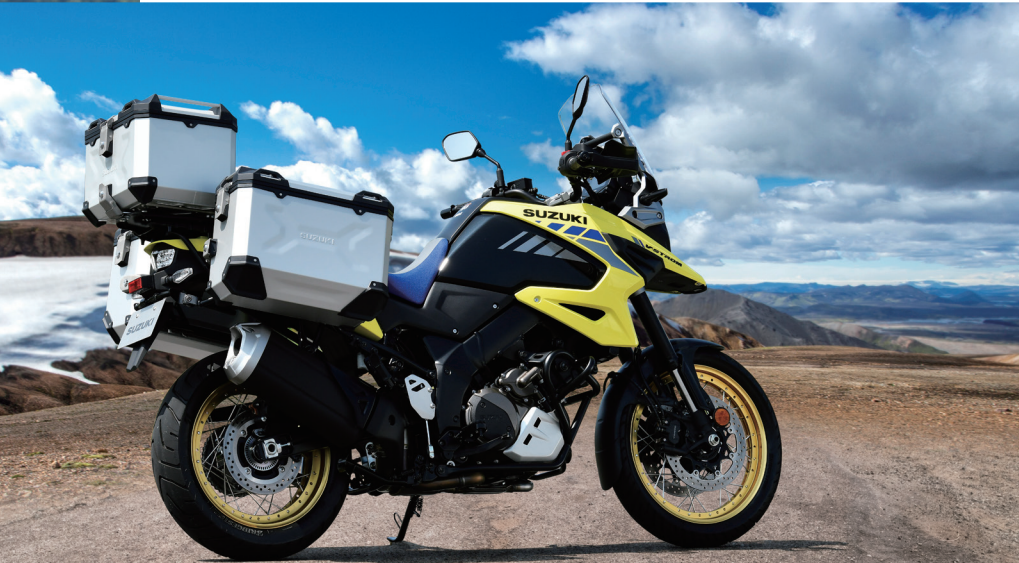
*Image shown with optional accessories..

The distinctive styling incorporates elements of both Suzuki’s legendary DR-Z desert racer and the large off-road model DR-BIG. The characteristic beak design first adopted by Suzuki stays true to Suzuki’s heritage while also further evolving the design to be more aggressive and bolder for the new generation V-STROM.