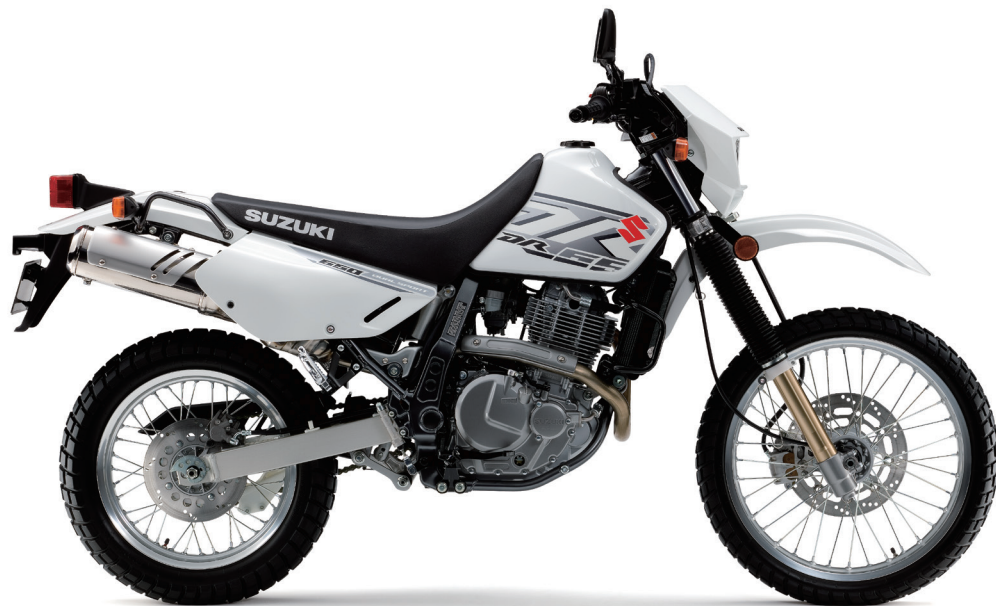
Solid Special White No.2 (30H)