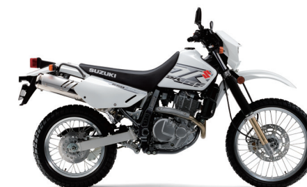
Solid Special White No.2 (30H)