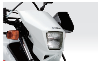
60/55W halogen headlight

■ 644cm 3 , 4-stroke, air-cooled with Suzuki Advanced Cooling System (SACS) engine is tuned with emphasis on powerful performance at low-to-mid engine rpm range.