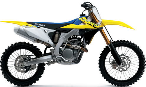
Champion Yellow No.2 (YU1)