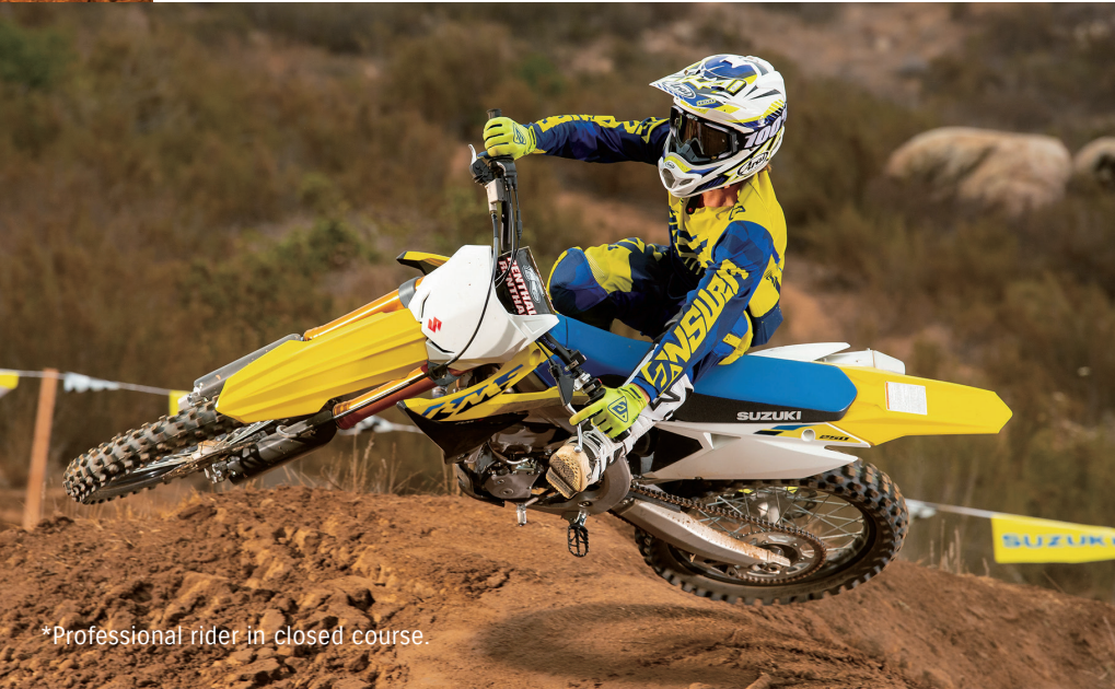
*Professional rider in closed course.

There's no resting on your laurels in motocross. Just as a rider's physical and mental training need constant updating to stay sharp, Suzuki has dipped into its vast bank of technological knowledge to keep the RM-Z250 at the top of its game. Take the challenge and own the competition!