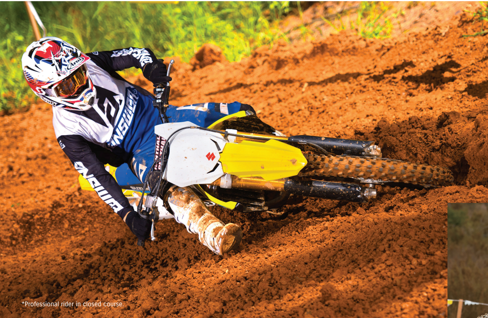
*Professional rider in closed course.

The motocross 250cc class race does not forgive even the smallest error. Achieving a win requires the right balance of “Run, Turn, and Stop”. Intensive work by our engineers has once again made the RM-Z250 the leader out of the gate, with an engine featuring increased power across the board and class-leading electronics, a lighter frame and swingarm plus updated suspension for even better handling.