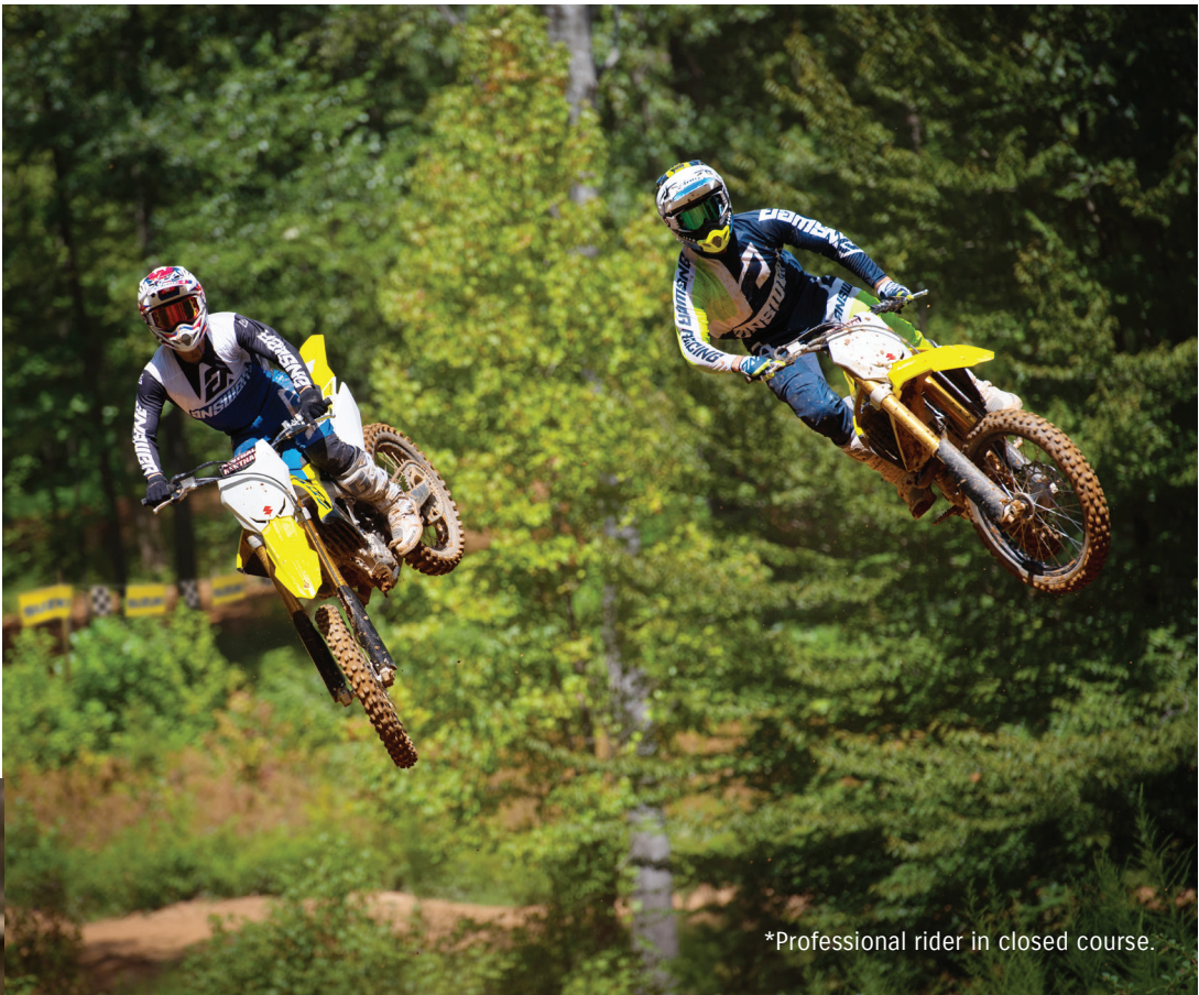
*Professional rider in closed course.